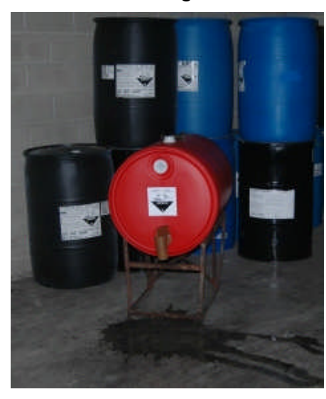
Eliminate hazardous spills and the clutter of hazardous, residue-containing drums.