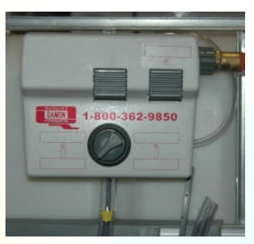
Optional multi-dilution equipment available